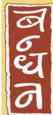
The Alumnae Association

This year "BANDHAN" held its event on 10th Oct., 2014. There were around 50 alumnae and 300 students who enjoyed the party together. The alumnae shared their past experiences with each other and enjoyed the programme while sharing the time spent together.